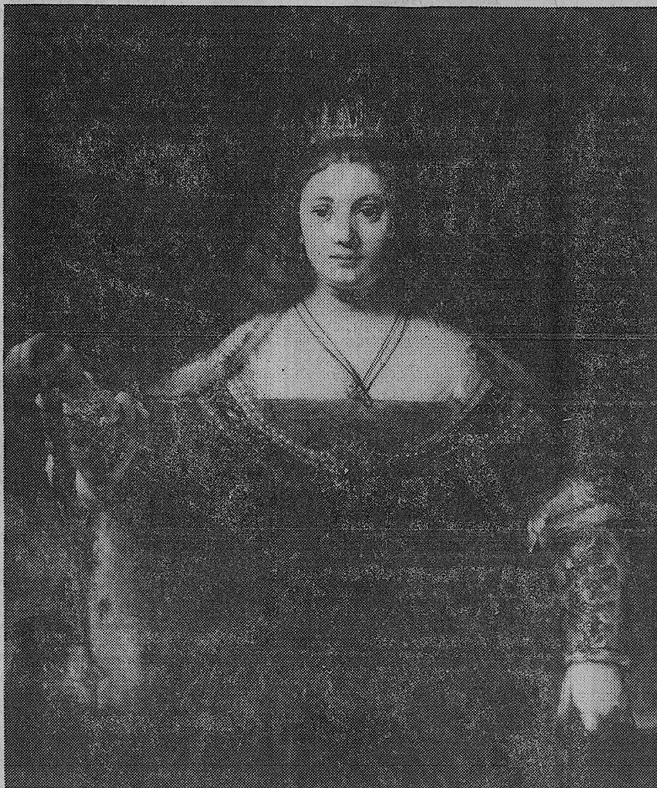
'Juno' in Armand Hammer Collection at Norton