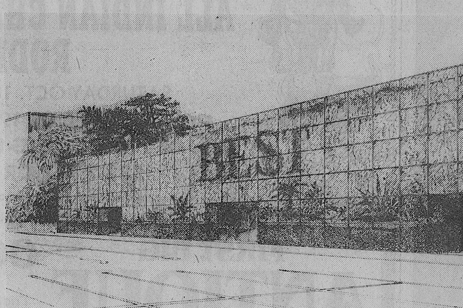
Architectural Models and Drawings at the Metropolitan in February and March